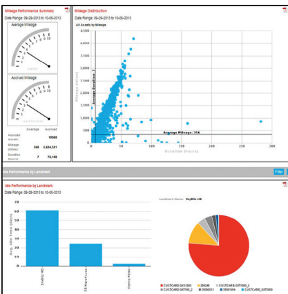
InSight Trends Dashboard