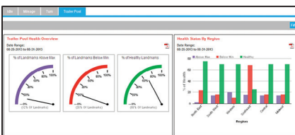
Trailer Pool Trends