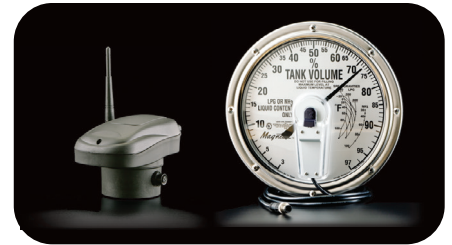
Propane and Gasoline