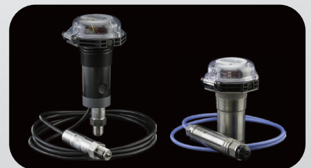
Class 1, Division 1