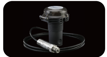
Petroleum, DEF, and Chemical Totes