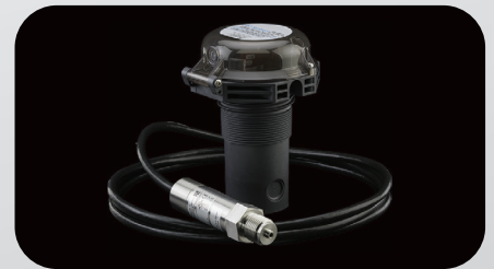
Petroleum and Chemicals