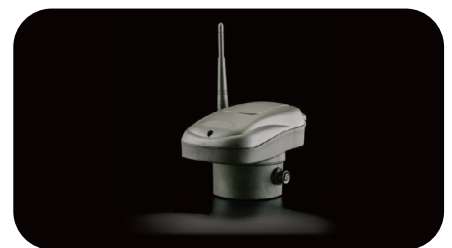
Underground Storage Tanks