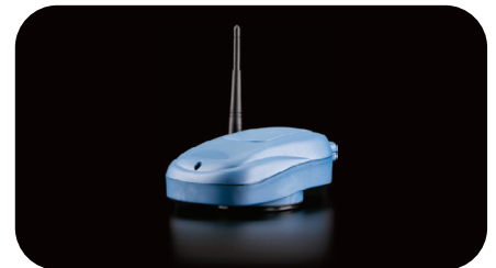
Uplink for Existing Sensors