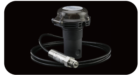
Petroleum and Chemicals