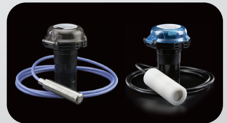
Non-Corrosive and Corrosive Chemicals