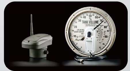
Propane and Gasoline